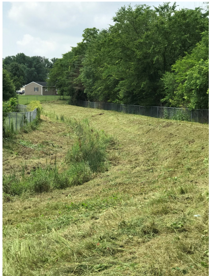
Before and After mowing photos of the Retention basin at Pleasant Ridge Subdivision